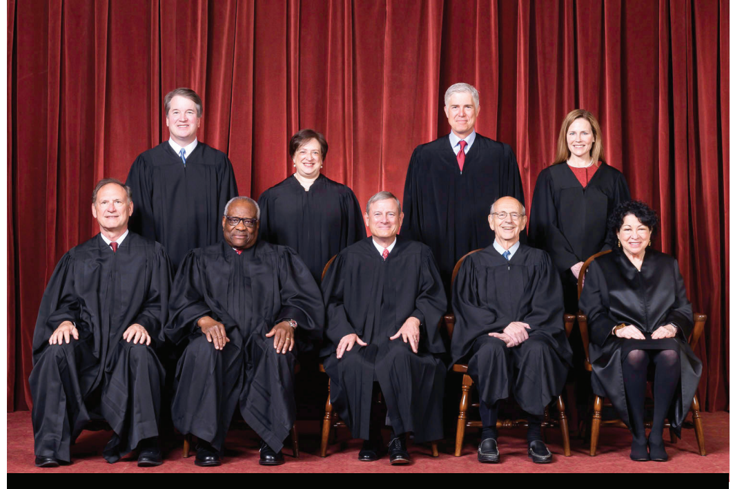
The extreme court: with a five-to-four conservative majority, the Supreme Court has shifted firmly to the right.

The court will hear an appeal from a website designer who said she refused to start creating pages for same-sex weddings because doing so would be at odds with her faith. The case bears similarities to a 2018 decision in which the justices sided with a Colorado baker who refused to make cakes for gay weddings, although the court avoided a